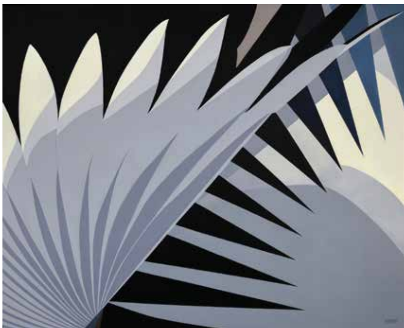
Now: Calm Palm , (2020) Acrylic on canvas / $ 4400