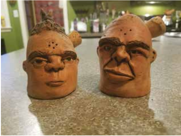
Then: Salt and Pepper Shakers , (2015) Ceramic / NFS