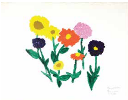
Then: Flowers , (1992) Acrylic on canvas / NFS