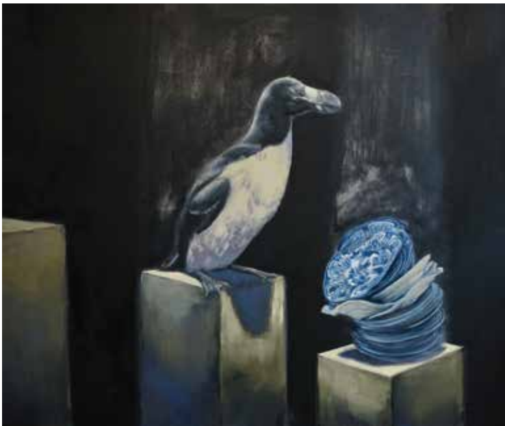
Now: Rhyme , (2020) Oil on canvas / $1830