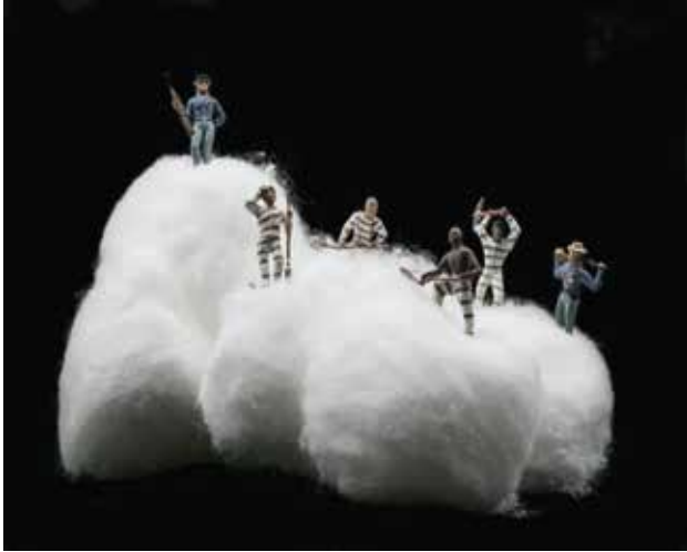
Then: Slavery 2.0 , (2017) Archival inkjet print / $125