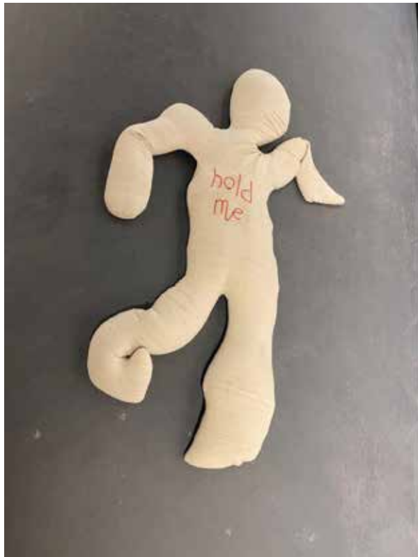
Now: Hold Me , (2021) Raw canvas, thread, gesso, red yarn / $666