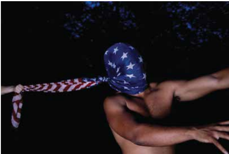
Now: Injustice For All no. 3 , (2020) Archival Inkjet Print / $200