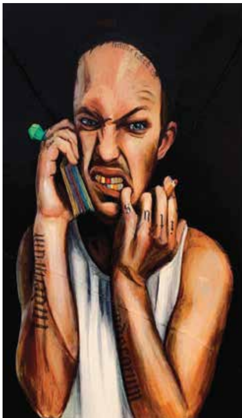
Now: Florida Boi , (2021) Oil on canvas / $1800