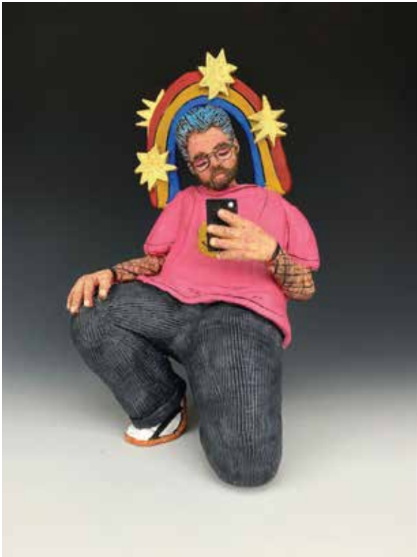
Now: Selfie's , (2021) Ceramic / $675