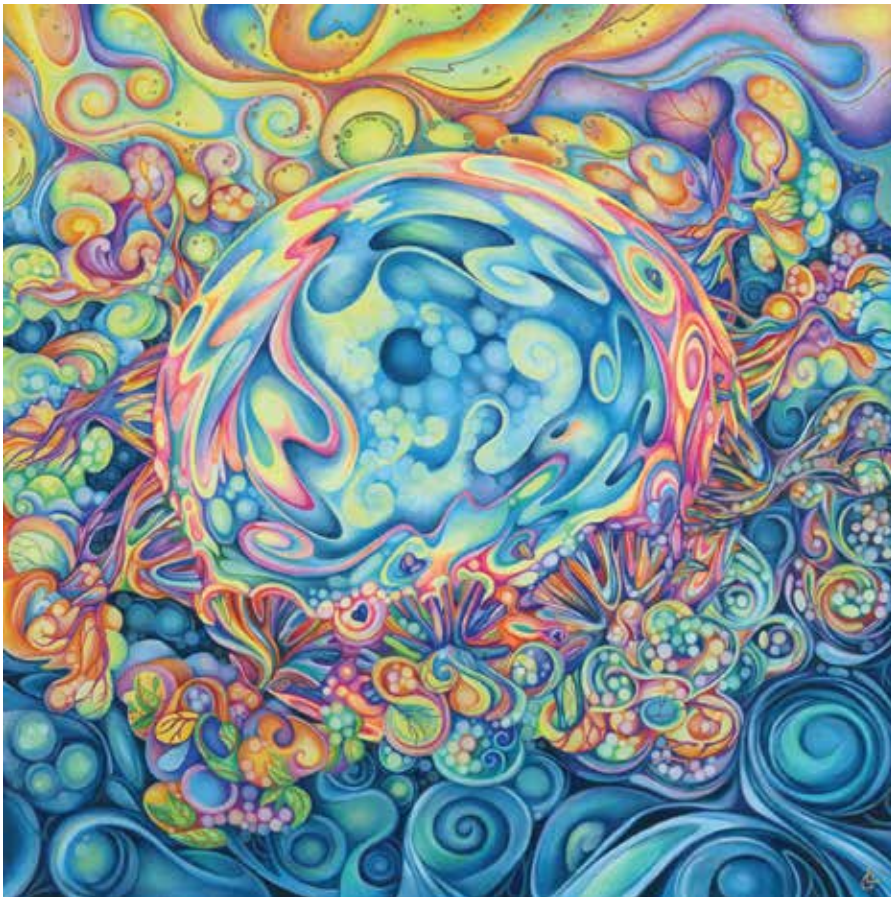
Now: Embracing Gaia , (2021) Colored pencil / $3,300