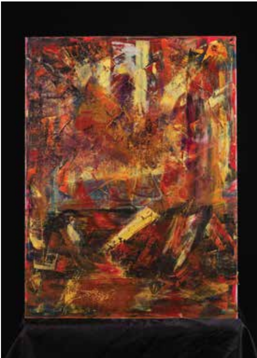
Then: Fortuna , (2014) Oil on canvas / $5000