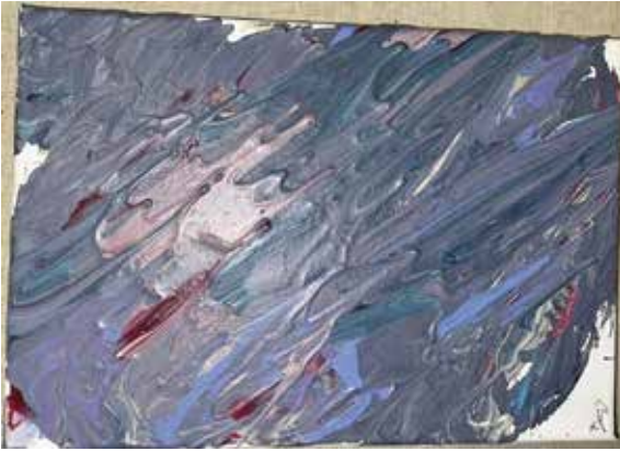
Then: Untitled, (2020) Acrylic on canvas / $100