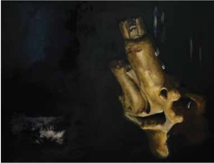
Now: Cyclops , (2020) Oil on canvas / $1640