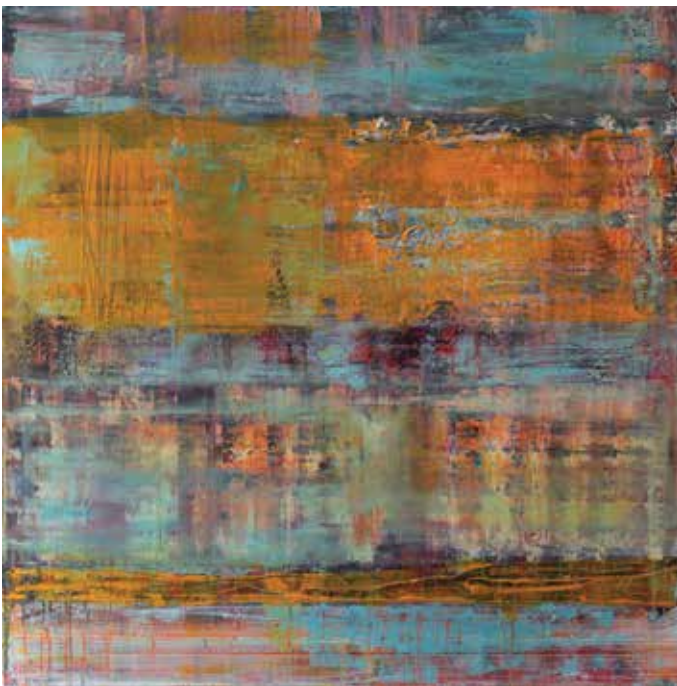
Now: Summertime , (2020) Acrylic on canvas / $2200