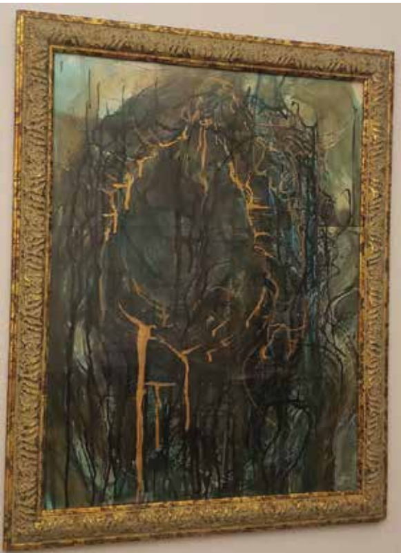
Now: Truth , (2021) Ink and coffee / $600