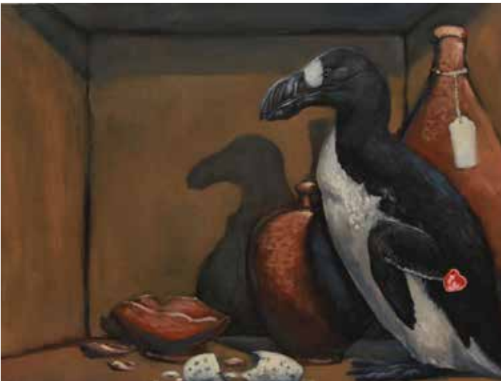
Then: The Fate of the Last Great Auk , ( 2017) Oil on panel / $430