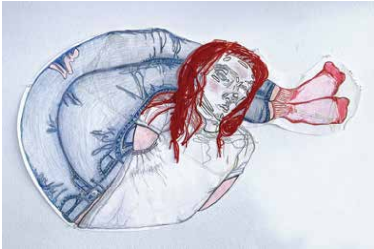
Then: BDD , (2019) Colored pencil on paper, tape, red yarn / $333