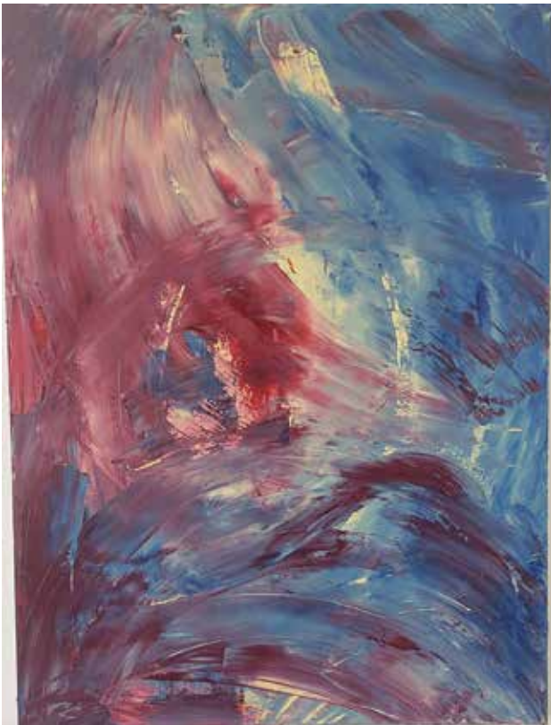
Now: This Painting is About Deceit, (2021) Oil paint on canvas / $450