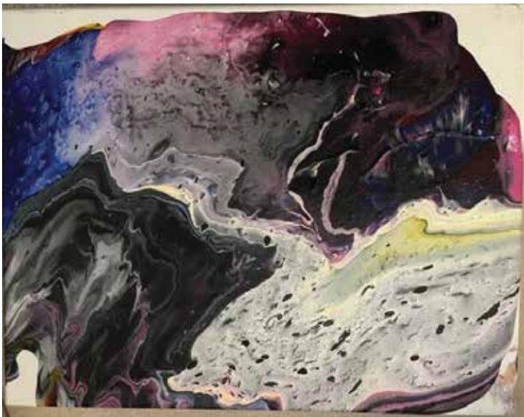
Now: Untitled, (2021) Acrylic on canvas / $150