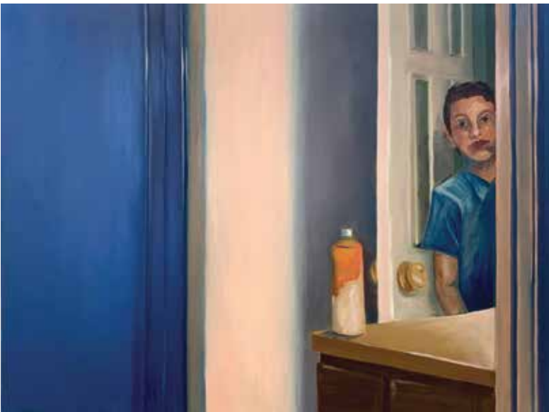
Now: Xavi Through Double Doors, (May 2021)