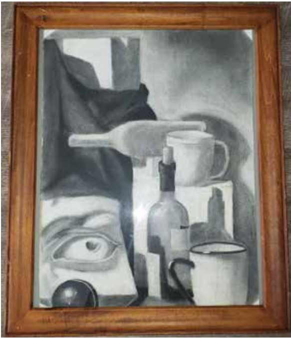
Then: Still life , (2013) Charcoal / $200