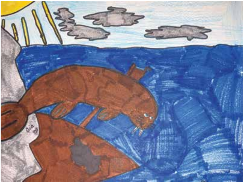
Then: Untitled, (2009)